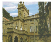
Victoria Hospital Bengaluru