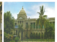
Vanivilas Hospital Bengaluru