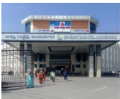
Dist. Government Hospital Ramanagera