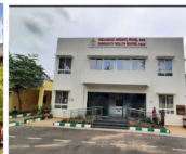
Community Health Centre Bidadi